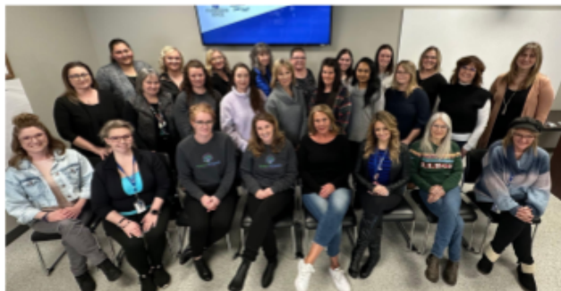
CESD Family School Wellness team